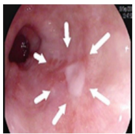
Fig.1: Superficial ulcer was found in the mid esophagus.