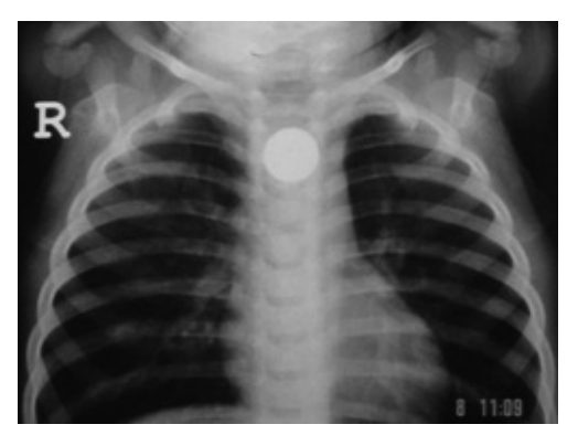
Fig 1: An ingested disc battery in the upper part of the esophagus.

of disc battery ingestion. However, 3 cases were referred with the above symptoms, and the battery was accidentally found during radiological studies. These 3 patients presented with intractable cough, mild cyanosis and dyspnea 18 days (5 to 45 days) after battery ingestion. All patients underwent chest X-ray examinations, and 17 cases received endoscopic studies. Three patients (14%) had esophageal battery impaction and 1 (4.7%) had small bowl impaction. The locations of disc batteries in the esophagus was 62% in the upper third (13 cases), and 19% in the lower third (4 cases). The others were: 2 in the stomach (9.5%) and 2 in the small bowl (9.5%). Figure 1 demonstrates an ingested disc battery in the upper part of the esophagus in a patient.